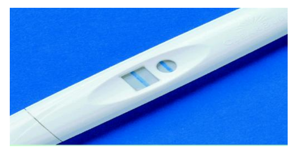
Figure2: PREGNANCY BIOSENSOR

The glass transducers were cleaned using a freshly prepared mixture of hydrogen peroxide and concentrated sulfuric acid (ratio 2:3) for up to 30 min and rinsed with Milli-Q water. After drying under a nitrogen flow, 25 \mu L of (3-glycidyloxypropyl)trimethoxysilane (GOPTS) were applied to the surface and reacted for up to 60 min. The silanized surface was rinsed with dry acetone and dried under a flow of nitrogen. Subsequently, the aminodextran conjugates were dissolved in Milli-Q water at a concentration of 2.0 mg mL–1 and applied for immobilization using an ink-jet dispenser. The remaining area between the detection spots was covered with non-conjugated aminodextran to prevent non-specific antibody binding (Tschmelak et al., 2004 and Tschmelak et al., 2005b).